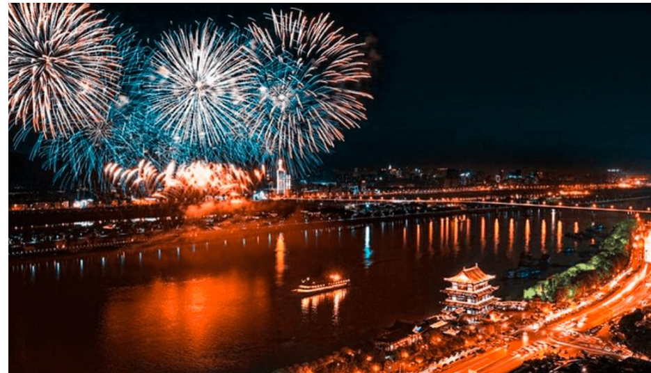
Landscape and food at Changsha