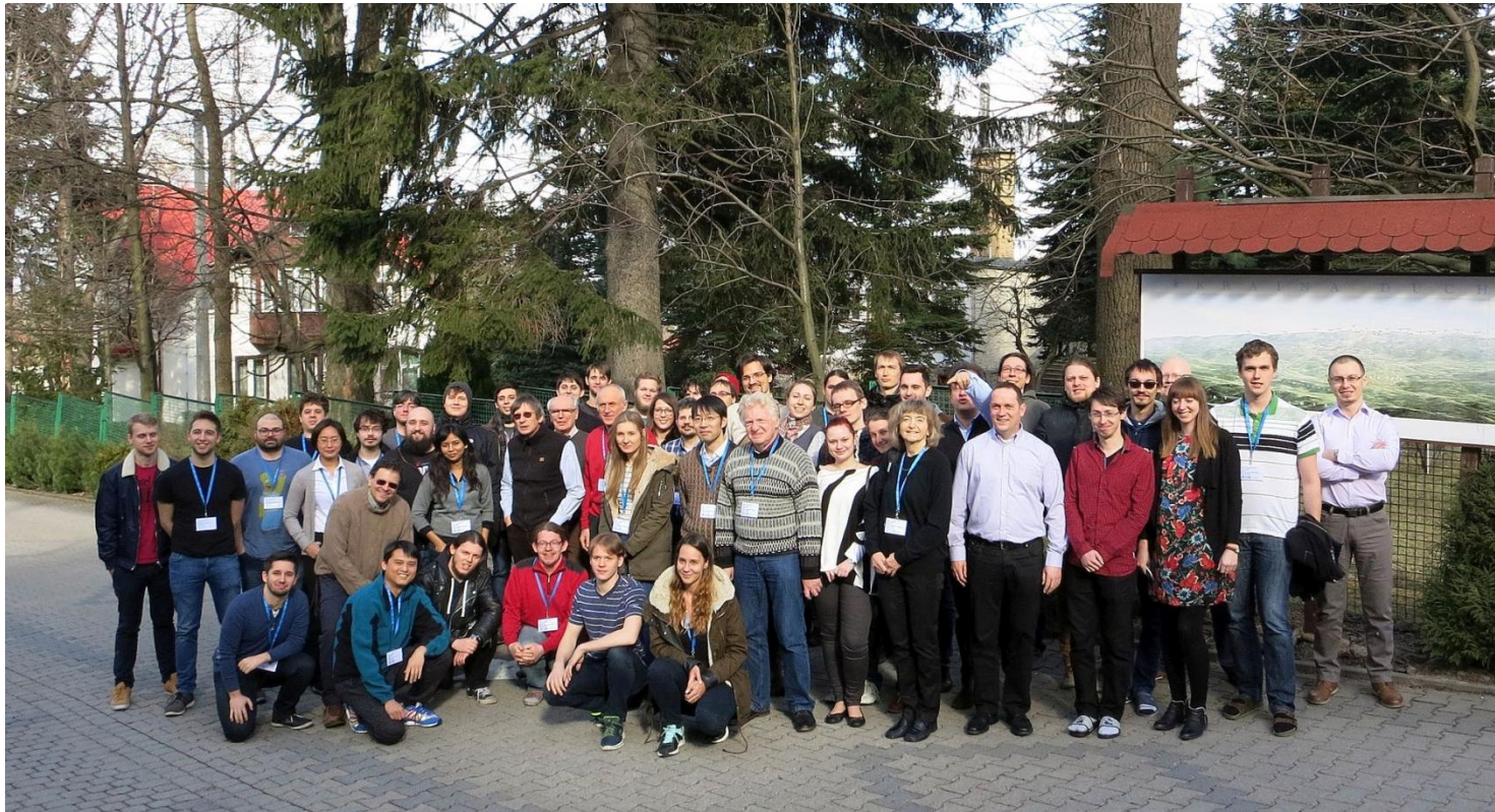
Lectures and participants of the 53th Winter School