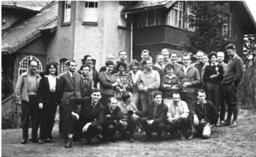
Lecturers and participants of the First Winter School