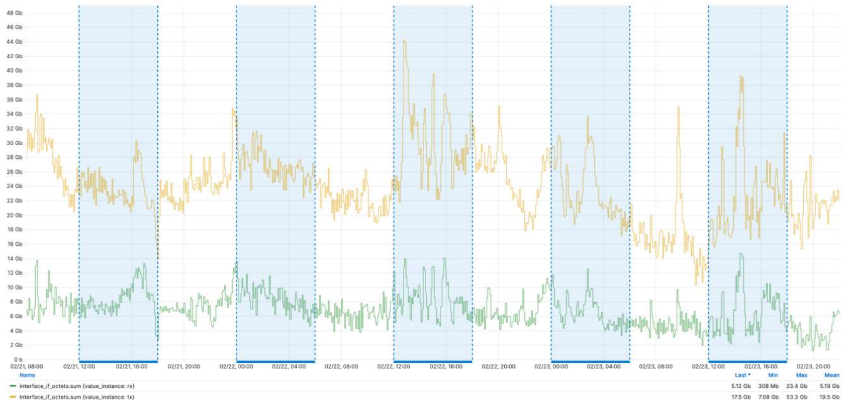
BBRv1 testing: 20 CMS nodes