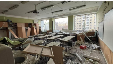
School in Lviv 29/12/2023