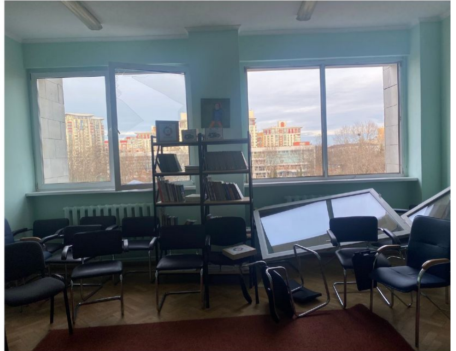
January 1, 2023. Department of Social Rehabilitation and Social Pedagogy of Taras Shevchenko Kyiv National University. Training rooms and laboratories. After the missile attack of russia.