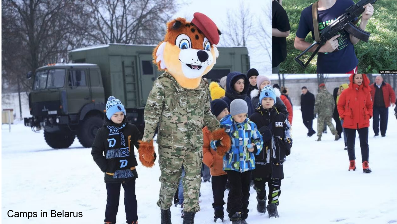
Camps in Belarus