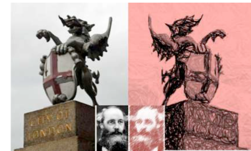
Kings College London