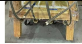
Figure 1: Coils on table with leads tucked into tubes under the table