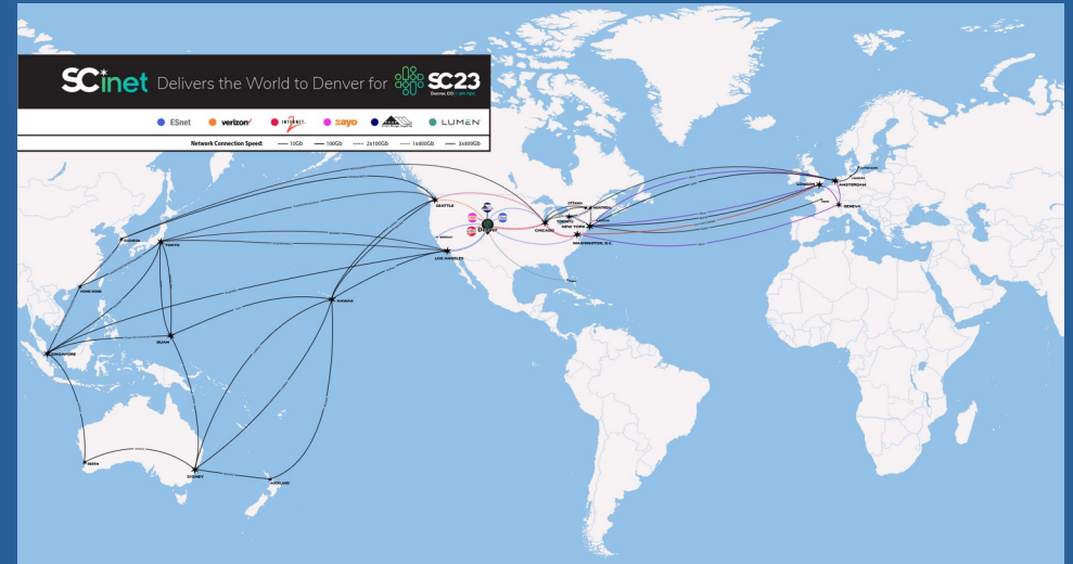
SC23 Network Map