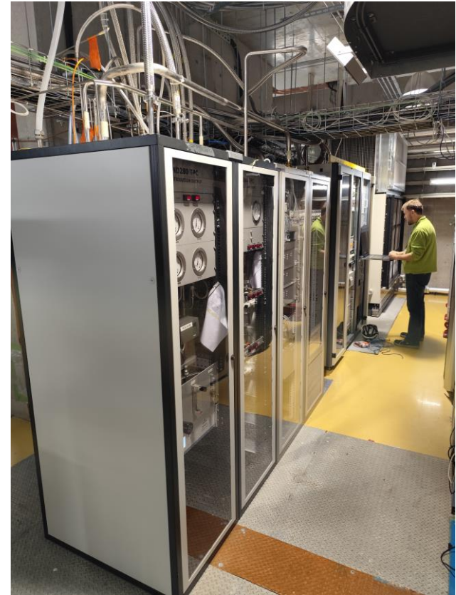
EP- DT Gas and Magnet control racks