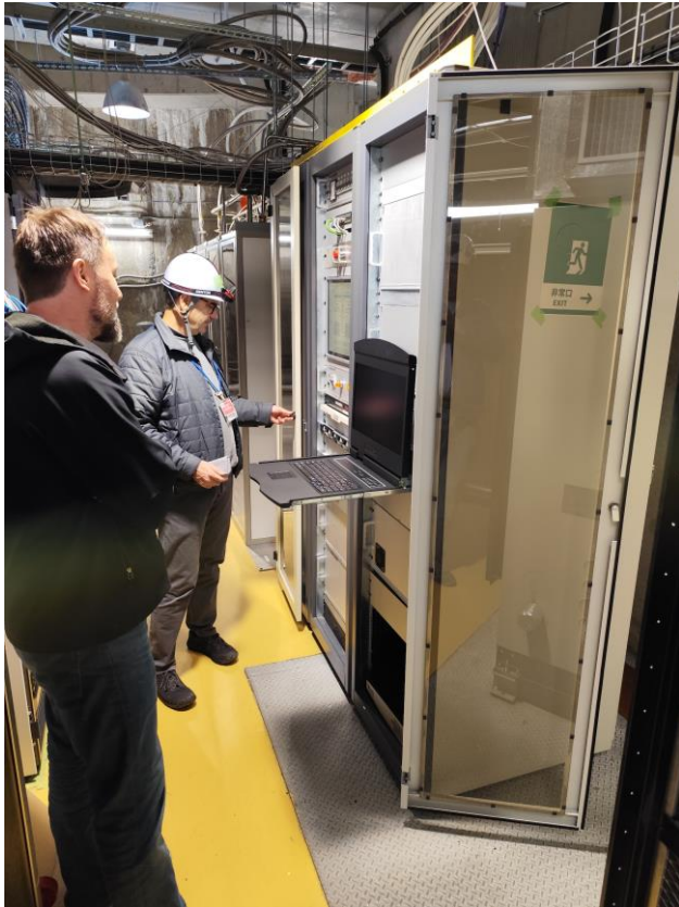
Magnet Control and Safety Racks