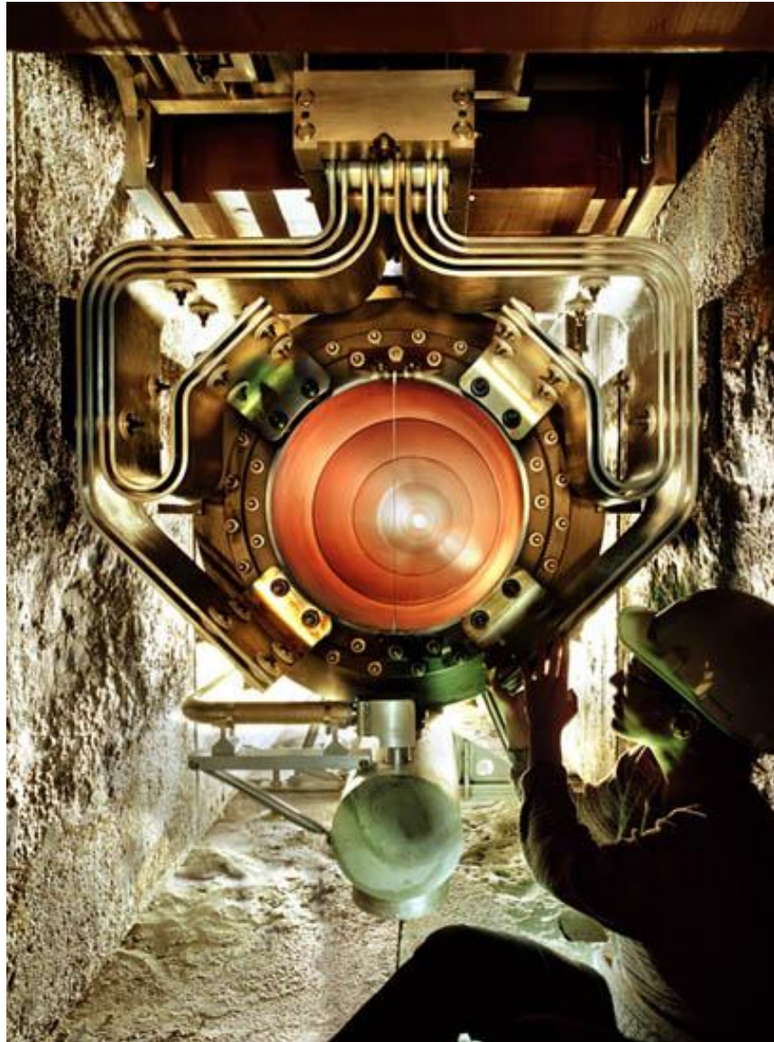
Target tip with drip