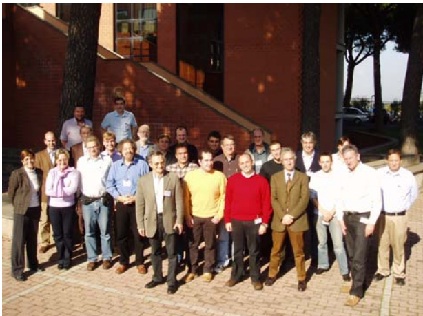
Figure 1: The IR'07 participants on the workshop site.

The IR'07 CARE-HHH-APD mini-workshop was organized at INFN Frascati from the 7th to the 9th of November 2007. The workshop was attended by 39 experts (Fig. 1), about half of whom came from CERN. The workshop scope covered the upgrade of the LHC interaction region (IR), the DAFNE IR upgrade, and plans for SuperB. More specifically, the key topics included the performance and limitations of the LHC-IR upgrade optics, the optimization of new LHC IR triplet magnets, the US-LARP magnet strategy (response to Lucio Rossi's "challenge"), heat deposition, early-separation dipoles, detector-integrated quadrupoles, crab cavities wire compensators and crab-waist collisions. The goals of IR'07 were threefold: (1) to narrow down the possible IR optics options and to converge on magnet parameters, (2) to identify the ingredients of the two LHC upgrade phases, and (3) to strengthen the collaboration with DAFNE/SuperB studies as well as to explore the applicability of advanced IR concepts to the LHC. The workshop web site http://care-hhh.web.cern.ch/CARE-HHH/IR07 comprises a link to the agenda and talks posted on INDICO.