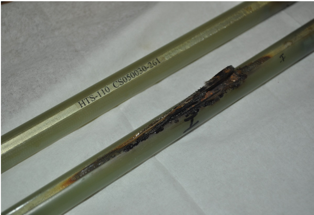
The previously burned out lead and a new lead for reference