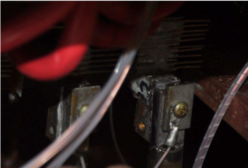
Top end joint for two of the HTS leads