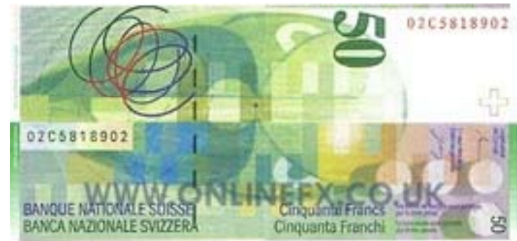
CCRC'08 registration form