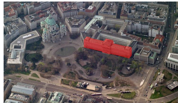
Venue (red) located at Karlsplatz with St. Charles Church to the left