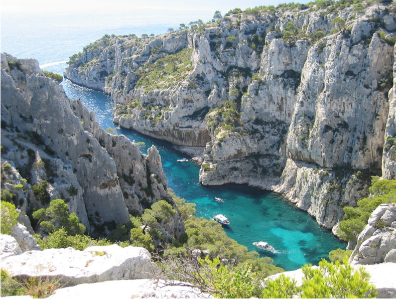
Parc des Calanques