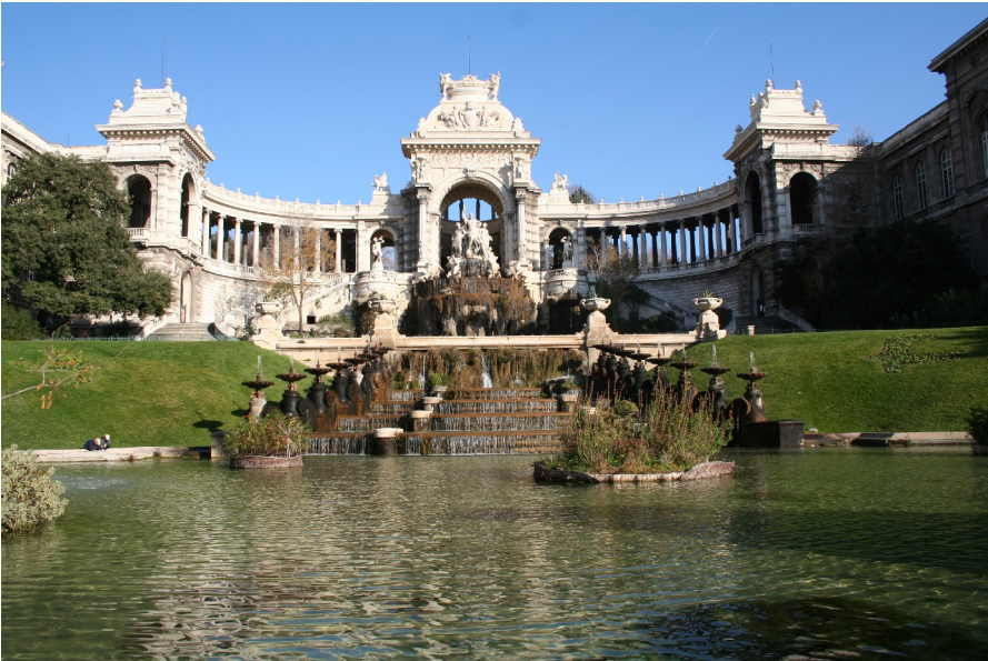
Palais longchamp – 1862