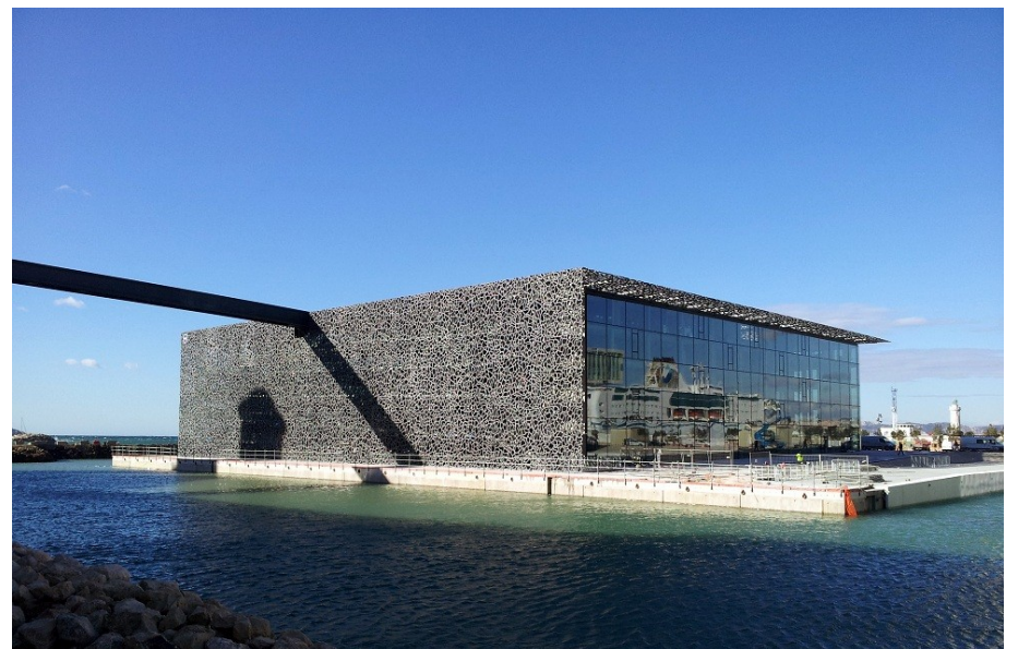
Mucem – 2013