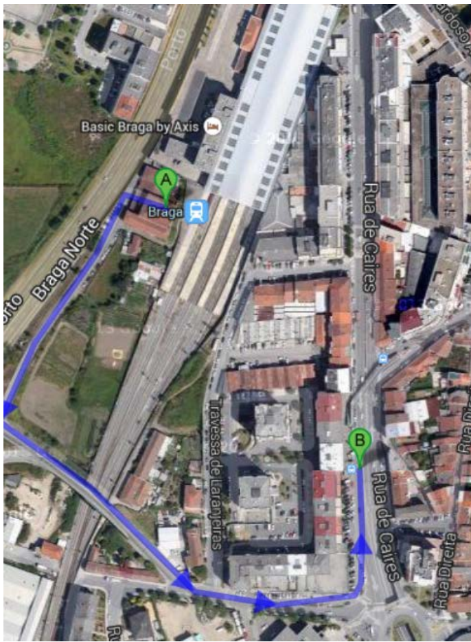
A Station – B Bus stop Nr.43