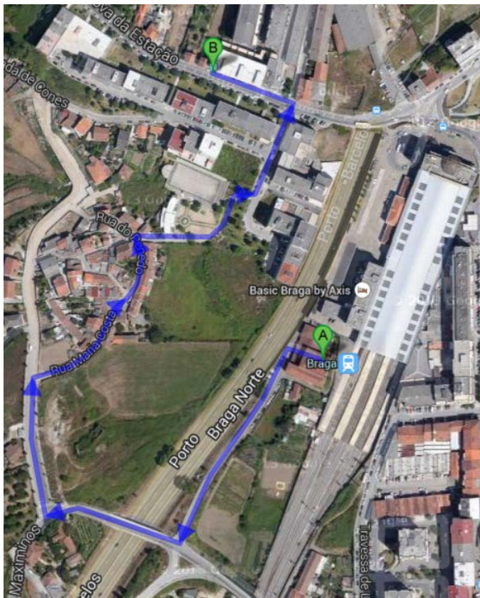
A train station B Bus stop Nr.2

Bus Nr 43 “Estação CF - Universidade do Minho”