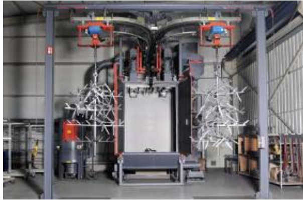
Surface processing with shot blasting