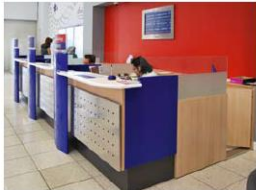
Eurobank: retail corporate identity with 5,000 complete work stations across Greece