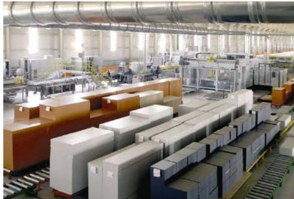
Cutting and finish processing of straight surface