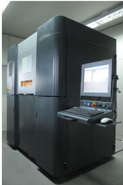
Rapid prototyping machine