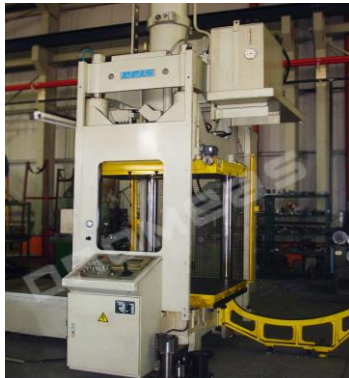
Press of new moulds testing