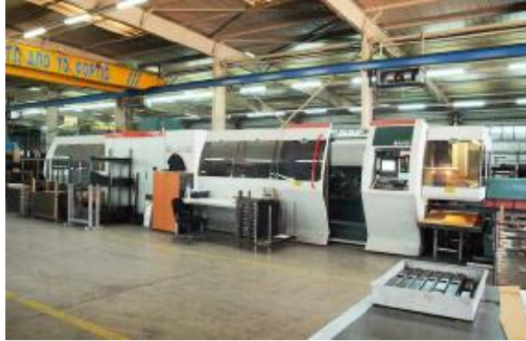
Cutting and perforation of tubes and profiles with laser rays