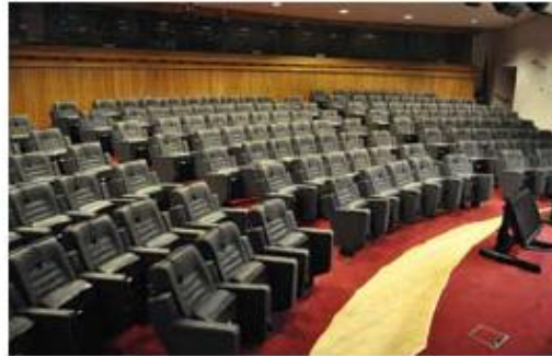
European Commission: special projects i.e. Commission's amphitheater