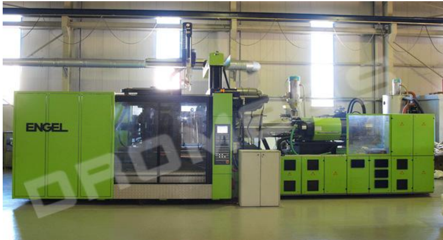
General view of the Plastic Die casting Department