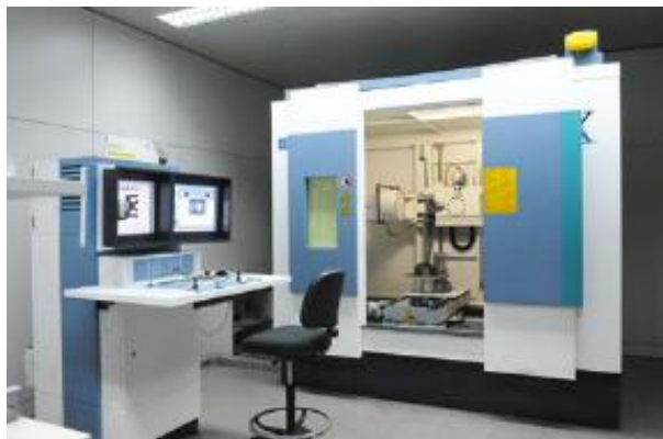
Internal control machine of aluminium structure with X-rays