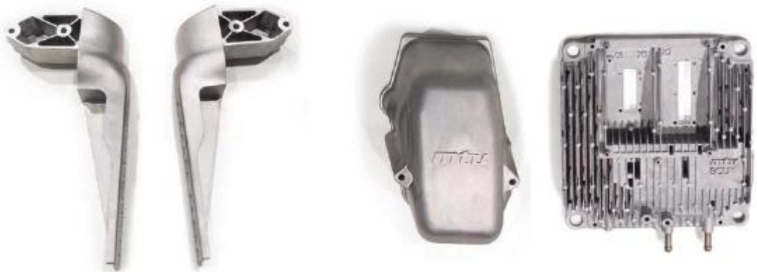
Aluminum die cast accessories for Mercedes Benz and MTU