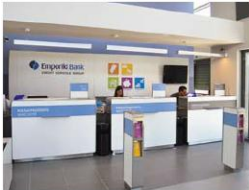
Emporiki Bank: retail corporate identity with 1,000 complete work stations across Greece