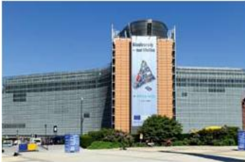
European Commission: thousand complete work stations across Europe