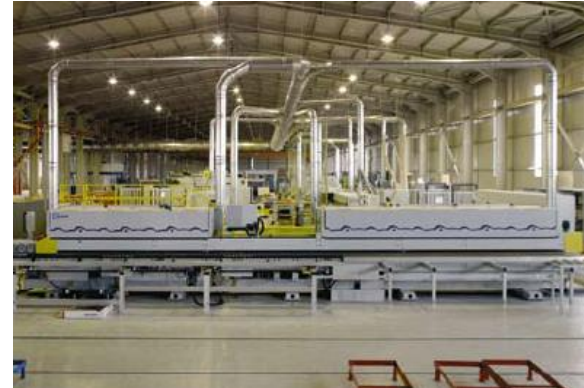
General view of the wood department