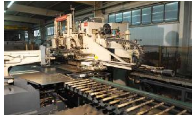
Flexible and complete system of steel sheets cutting and forming