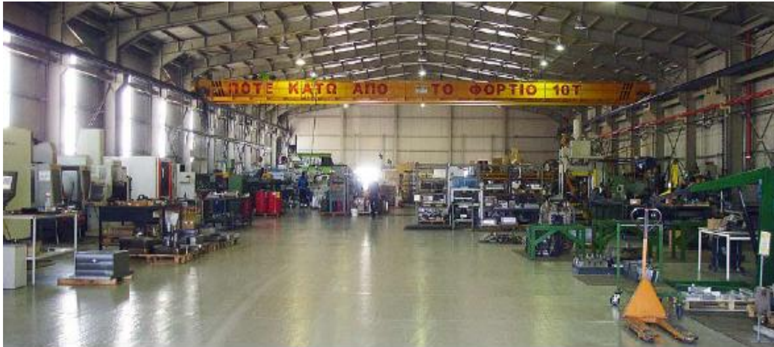
General view of the Mould department