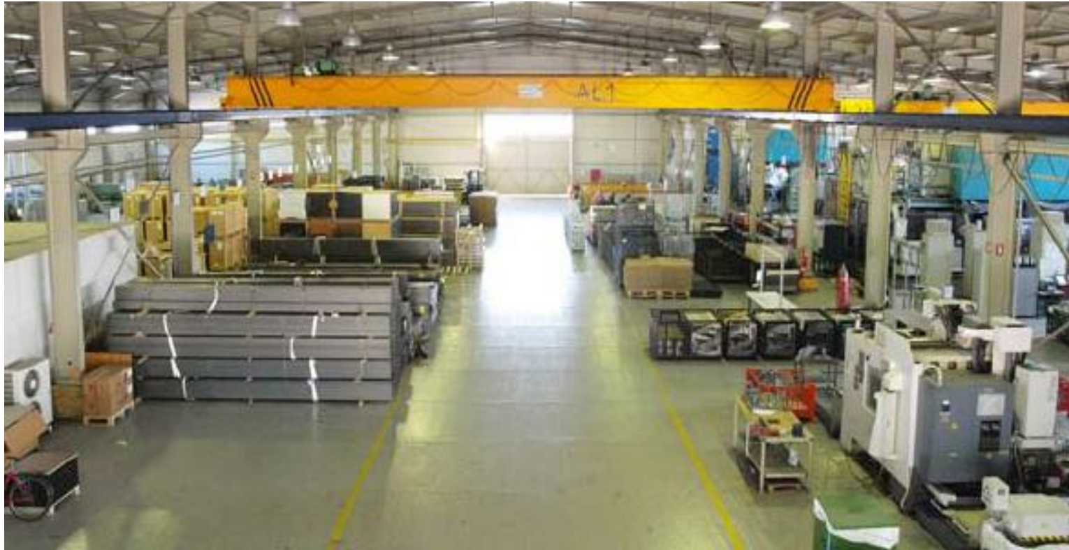
General view of the Aluminium Die-casting Department