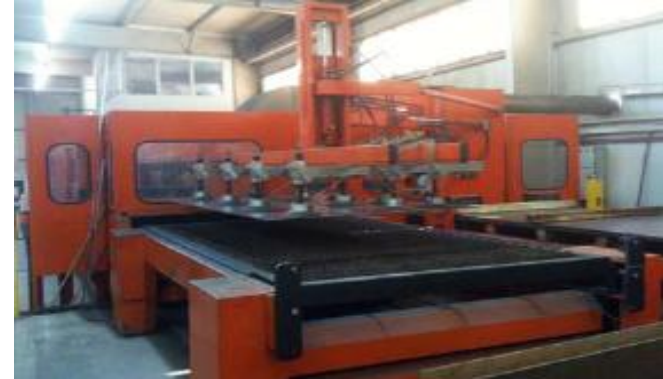
Laser cutting of steel sheets