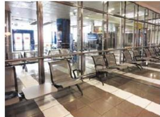
Hellenic Airports: 18,000 waiting seat systems across Greece