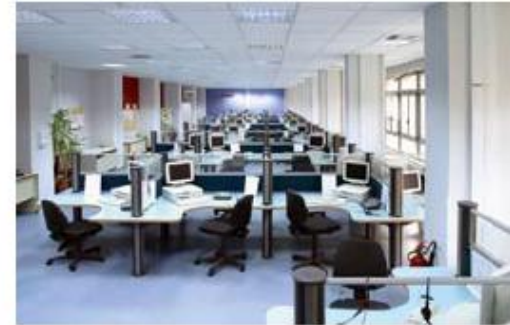
Hellenic Telecommunications Organization: 5,000 complete work stations