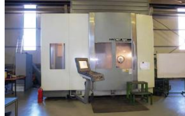
3 and 5 axis processing centre