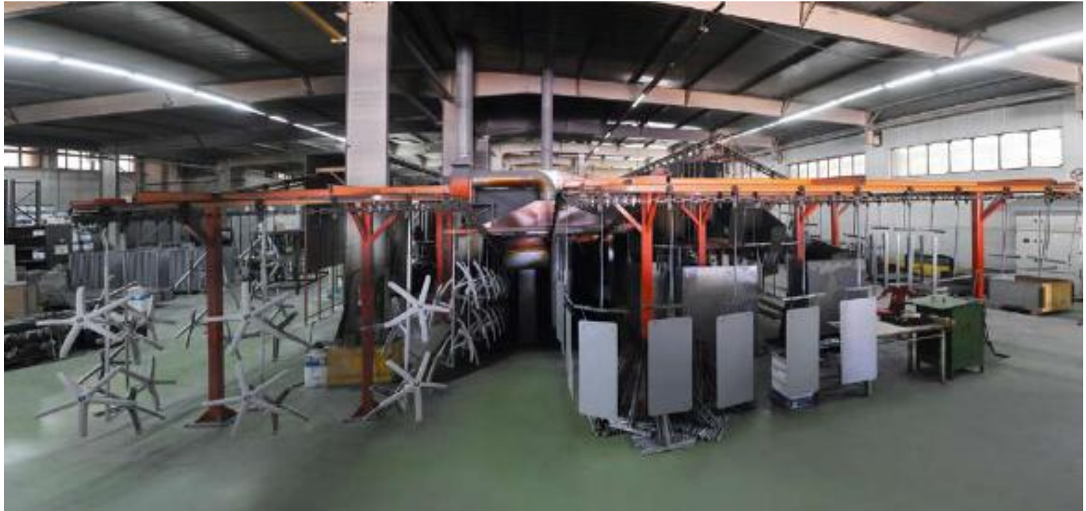
Complete system of electrostatic paint