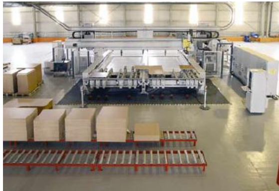
Processing centre of curved surfaces