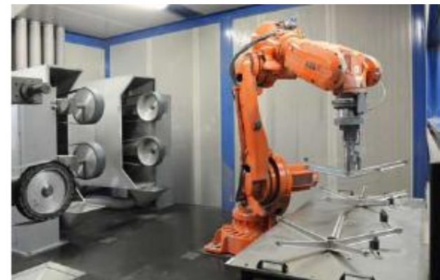
Department of Sharpening - Polishing with robotic use