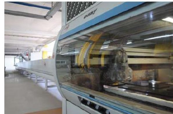
Painting and varnish of wooden surfaces