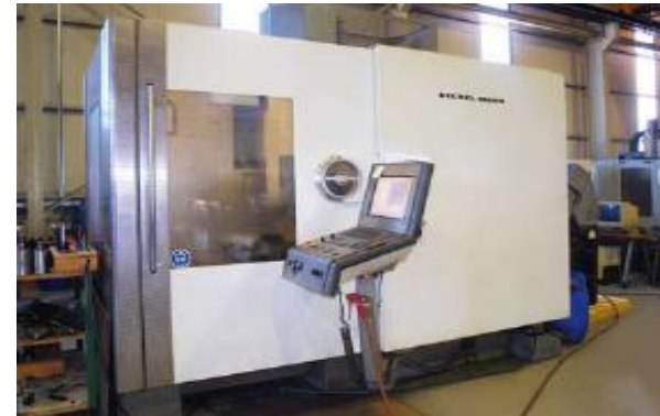
3 axis CNC machine