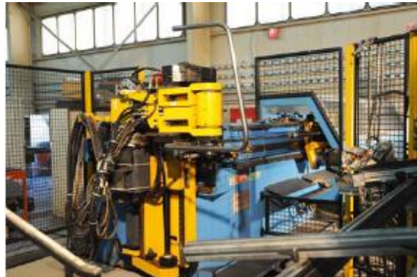
Digital guided tube bending in 5 axis