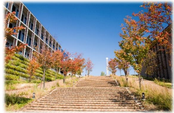
Katsura Campus of Kyoto University

This workshop is supported by SPRITS Program of Kyoto University and The Kyoto University Foundation.