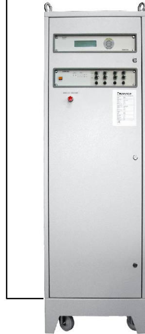
DC power supply