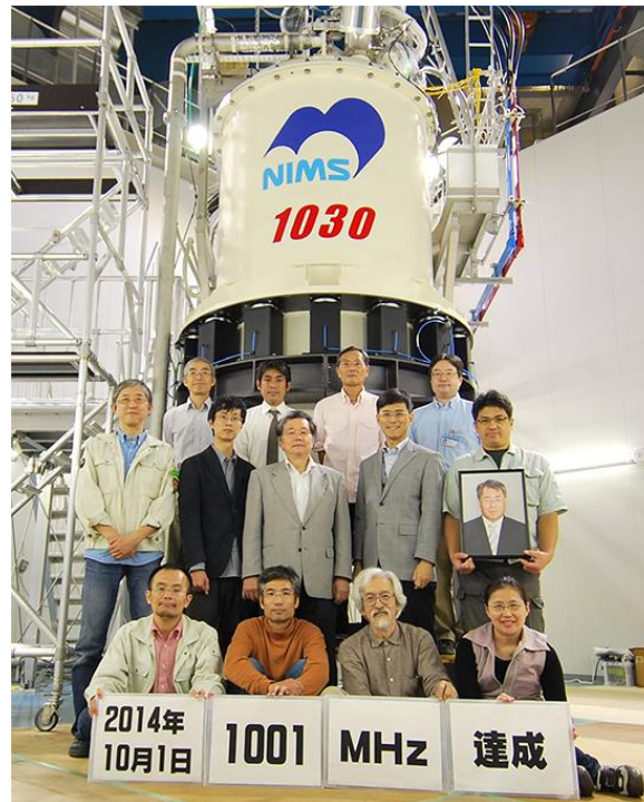
>1GHz LTS/Bi-2223NMR magnet