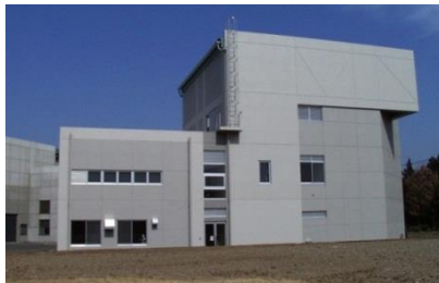
NMR building in NIMS