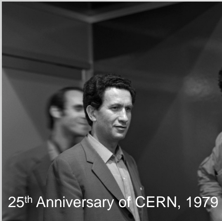
25 th Anniversary of CERN, 1979