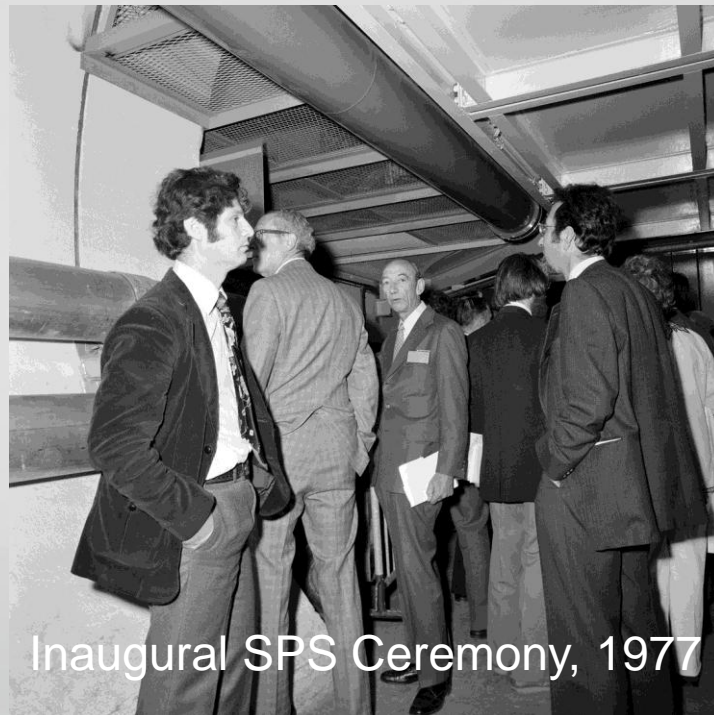
Inaugural SPS Ceremony, 1977

...personal note: two of my mentors and role models