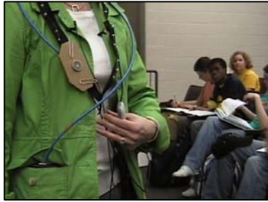
Fig. 9. ultrasonic emitter