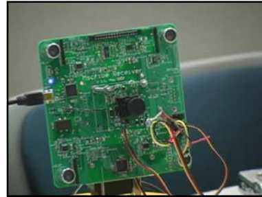
Fig. 10. receiver board prototype