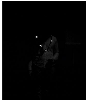
Fig. 8. IR views of old vs. new necklaces in direct sunlight