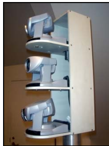
Fig. 4. tracking cameras