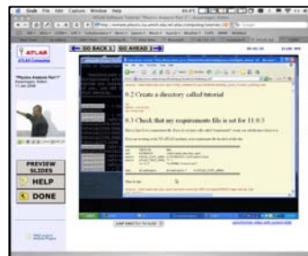
Fig. 1. Web Lecture

A slide index is also available so that the viewer can see thumbnails of all the slides at once, and jump directly to any point in the video based on these slides. Users may also navigate forward or back at will to skip unwanted sections or repeat poorly understood information. The Web Lectures were designed using HTML that makes it easy to evaluate the media server logs to obtain usage statistics. Using the RealPlayer plug-in provides compatibility with all major operating systems.