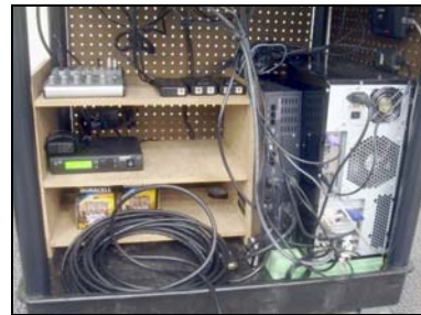
Fig. 5. A/V and computer equipment