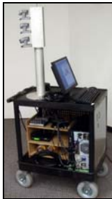
Fig. 3. recording cart

After each recording, the carts were plugged into the internet and automatically uploaded the recorded media to our archival server. Dedicated media processing servers then retrieved the media and created Lecture Objects, which were put into the Lecture Object archive for long term storage. Then RealPlayer-based Web Lectures and QuickTime video podcasts were created and uploaded to web servers. Most of this post-processing is automated, with a few remaining steps still requiring human intervention.