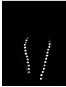
Fig. 6. Necklace in color and IR