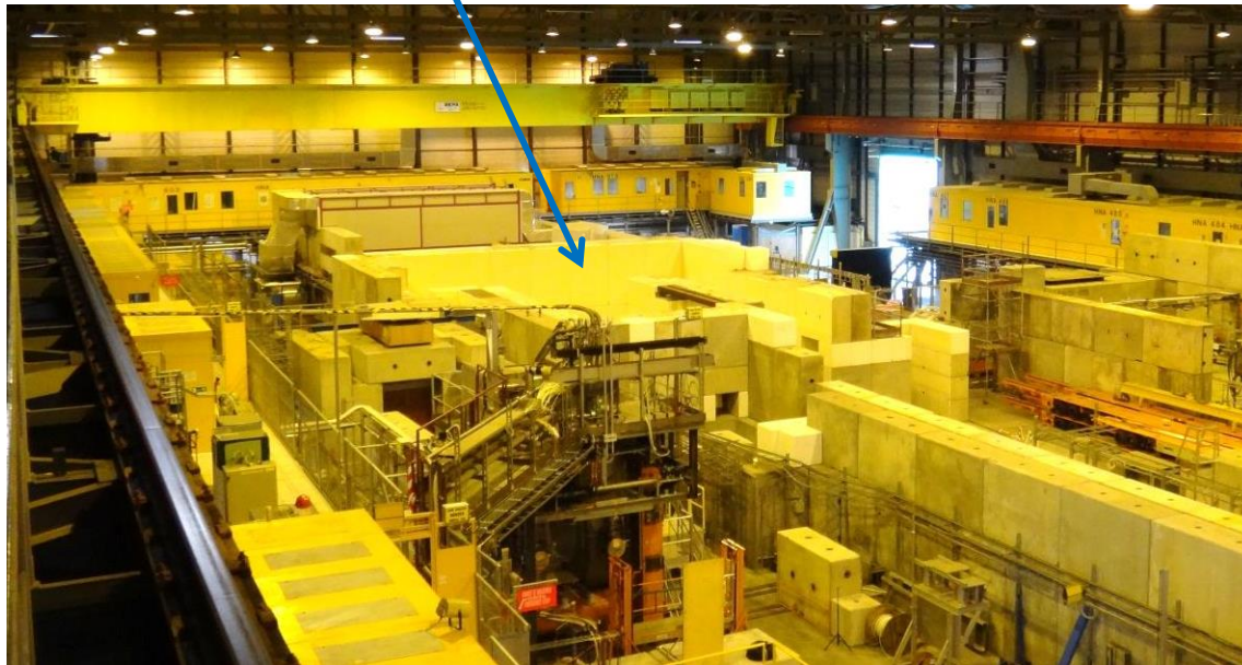
GIF++ facility in the ENH1 experimental hall

Others (from users) will be completed soon.