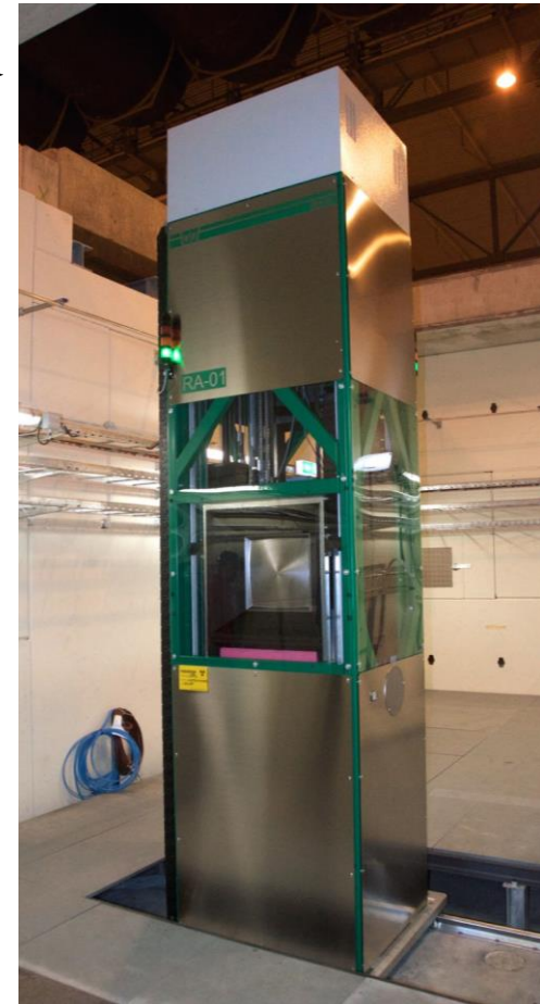
The new 14 TBq ^{137}\text{Cs} irradiator