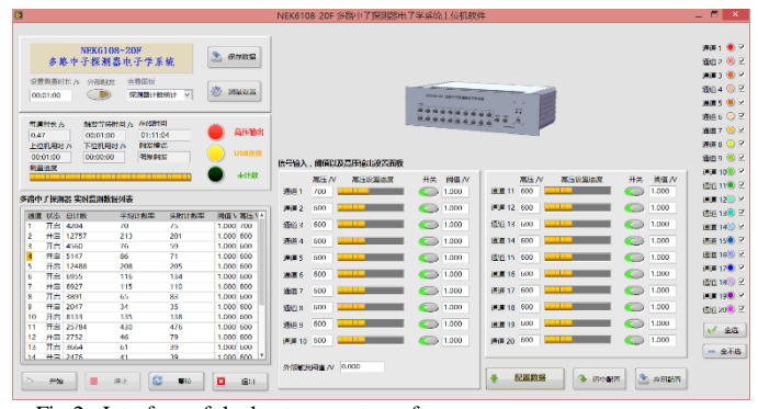
Fig.2 Interface of the host computer software.

The structure of data acquisition system is shown in Fig. 3. The front end circuit is composed of signal conditioning modules and discriminators. Neutron signals can be shaped and screened by setting the screening threshold parameter by user. The counting module receives the signals which are screened, then adds counters and saves the results to RAM. The parameters, like measurement time, the depth of storage, trigger mode, can be set by timing controller and monitoring module according to the user needs, the start and stop of the measurement can be controlled by external trigger signals or the host computer. The module is also responsible for controlling the high voltage output and monitoring the high voltage feedback by setting the high-voltage DAC module and the high-voltage ADC module.