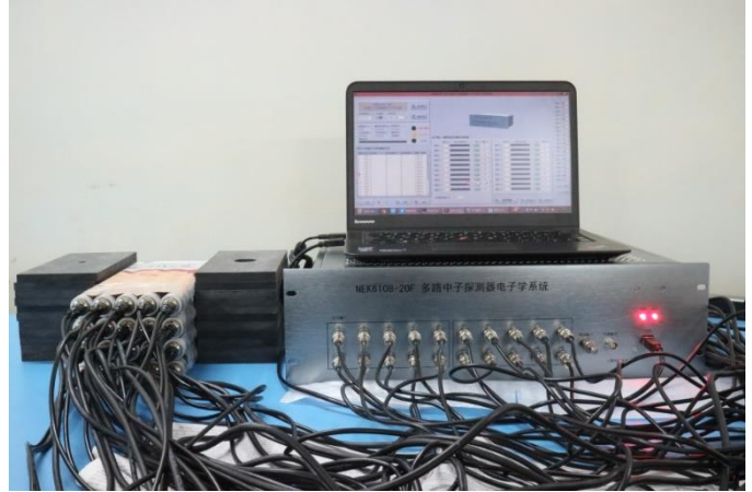
Fig. 1. Photo of the readout system which has 20 neutron detectors (crystal ST-401 and PMT), the electronics system and the software.

the design of modular power supplies, high precision DACs and the high voltage feedback circuit, and has the features of security and stability, high integration, etc.