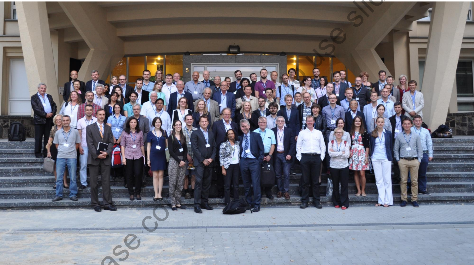
ENLIGHT Meeting @ Krakow, September 2015