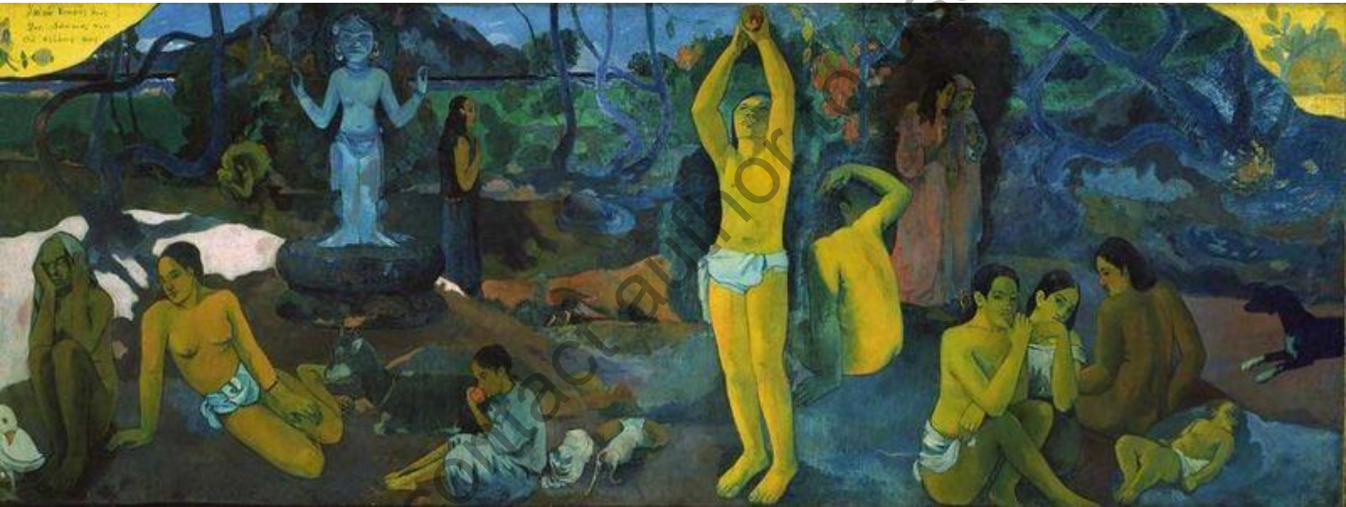
D'où Venons Nous / Que Sommes Nous / Où Allons Nous (Paul Gauguin)

2014: Where Do We Come From? What Are We? Where Are We Going?