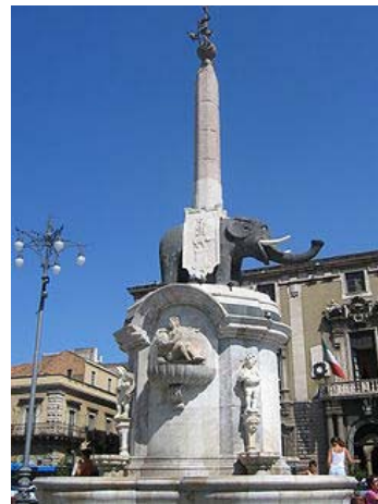
Catane fontana dell elefante