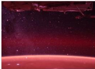
Dark Skies ISS Image pattern recognition