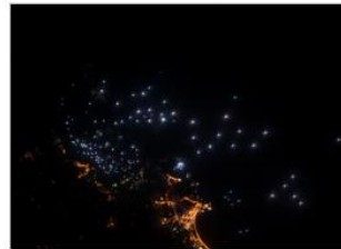
Lost at Night Locate a City in images f...