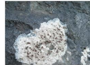
Air Quality with Biomarkers: Lichens Air Quality using Lichens...