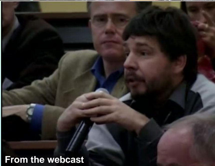
From the webcast