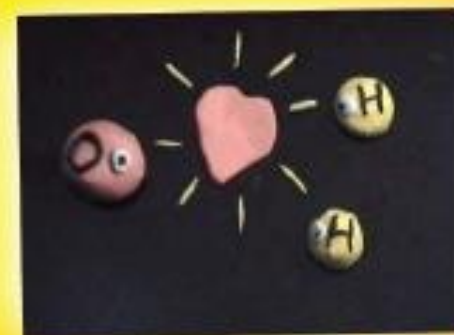
Dame Alice Owen's School