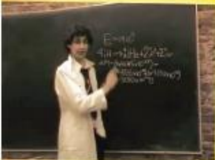
Torquay Boys' Grammar School

Are you a GCSE or A-level student with a passion for physics?