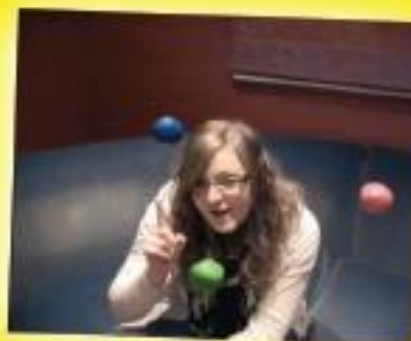
Wirral Grammar School for Girls