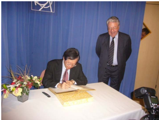
Nov. 21 Mr. T. Sakata (MEXT Deputy Minister)