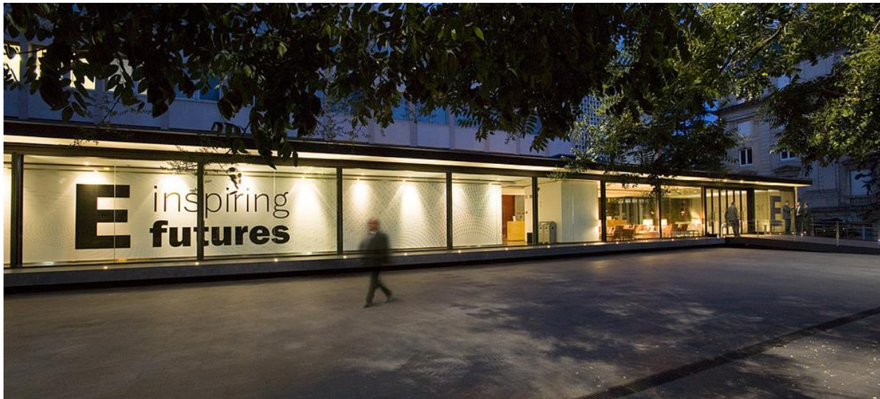
Entrance to ESADE Business School