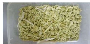
Figure 4. The shredded Thai-style instant rice

The influence of drying temperature from 1000W/m 2 increase in rehydration ratio by 40.2% and 59.3%. As earlier described that the higher temperature induced a larger pore, such a high volume expansion of the pore enhanced water absorption during rehydration and greater water retention inside the material cells, results in the higher degree of rehydration. The 9 point hedonic scales of the shredded Thai-style instant rice showed in softness and color and overall acceptance were very similar.