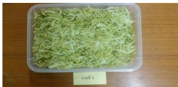
Figure 3. Freshly shredded Thai-style rice