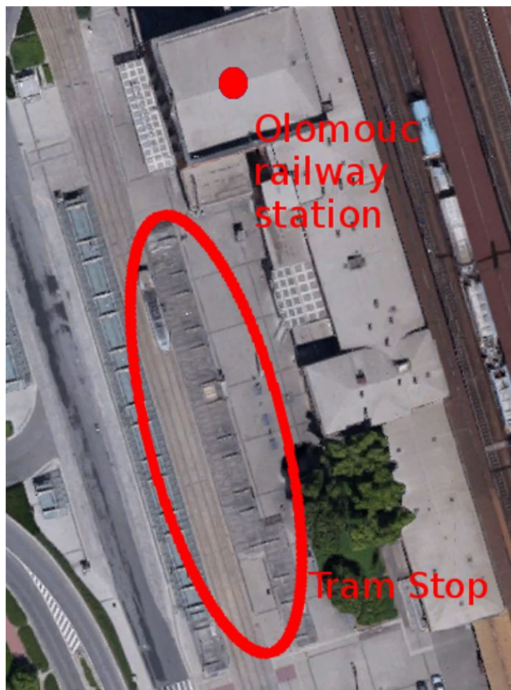
Tram station at the Olomouc railway station

The NH Collection Hotel is about 3 km far from the Olomouc main train station. To get there, you can either walk by foot (not recommended), or by public transportation. The tram stop is just outside of the Olomouc main train station building, see map below. You can use the tram lines 3, 4, 6 (6th stop) 7 (5th stop), to get to the tram stop Náměstí hrdinů or tram 2 to Palackého (6th stop) The ride is about 9 minutes long. We will try to provide you with a ticket by a person in the main railway station hall to be present during Sun afternoon (look for the Top2016 sign:). In case you arrive outside his/her duty hours, the tram ticket can be obtained from orange-colored ticket machines, which are placed at all tram stops or you can use ticket machine placed in the Olomouc main train station by the exit on the left. The price for the ticket is 14 CZK. Trams leave every 5 minutes, but intervals between tram departs are prolonged in the evening to about 15 minutes.