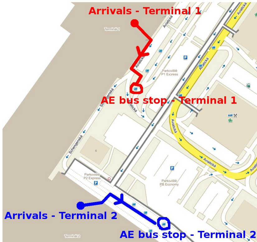
Prague Airport with indicated AE bus stops

Prague main train station (Praha hl.n.) ---> Olomouc Main train station (Olomouc hl.n.)