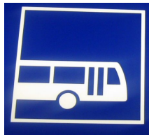
Sign for AE bus stop

The return journey is the reverse of the above description except few details. You can find the selected train connections from Olomouc to Prague here . When you get to the Main Train Station in Prague, you need to find the AE bus stop for the bus to the airport. The timetable for AE buses to the airport is here . Be aware that the AE bus stop is not so easy and straightforward to find. It is positioned at different location as when you arrived from the airport - it is in front of the historical building of the train station on the motorway. You can find it by following one or both of these signs: