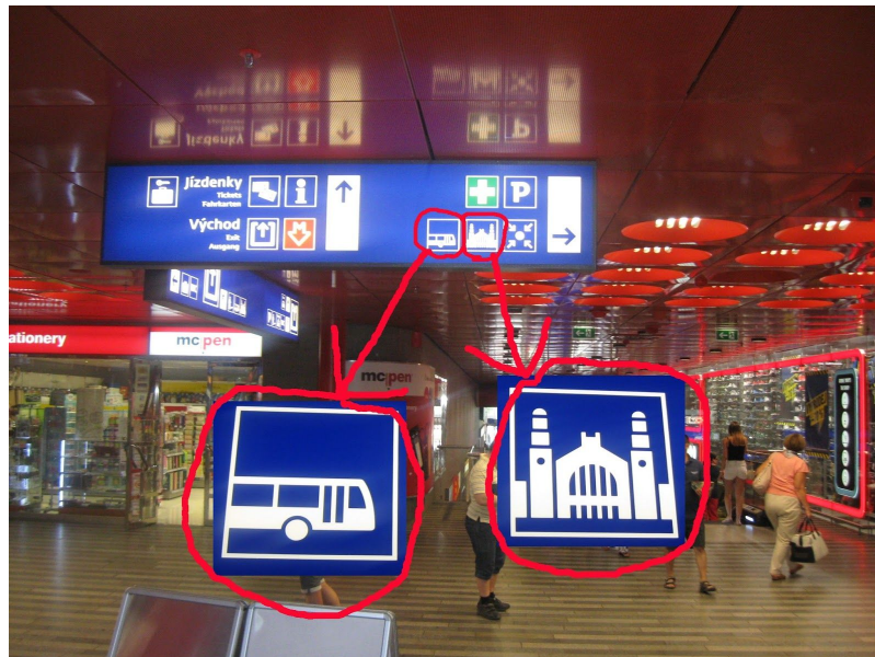
An example information table indicating the direction to the AE bus stop to the airport at the Main train station in Prague