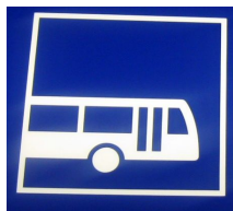
Sign for AE bus stop

The return journey is the reverse of the above description except few details. You can find the selected train connections from Olomouc to Prague here . When you get to the Main Train Station in Prague, you need to find the AE bus stop for the bus to the airport. The timetable for AE buses to the airport is here . Be aware that the AE bus stop is not so easy and straightforward to find. It is positioned at different location as when you arrived from the airport - it is in front of the historical building of the train station on the motorway. You can find it by following one or both of these signs: