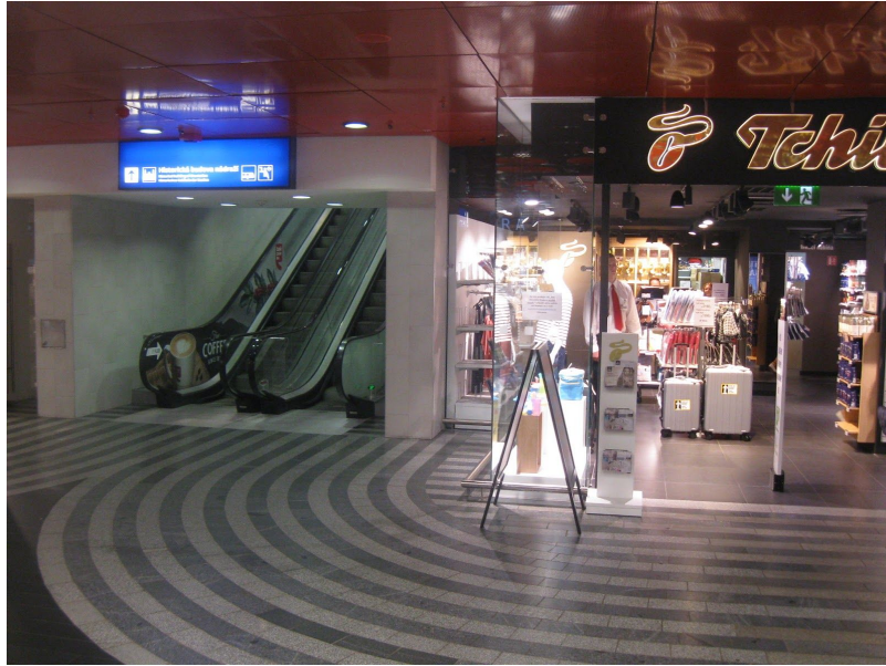
Stairs to the historical building (next to the Tchibo shop)