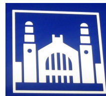
Sign for historical building