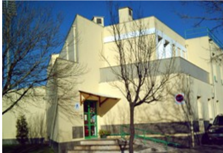
Aveiro Youth Hostel