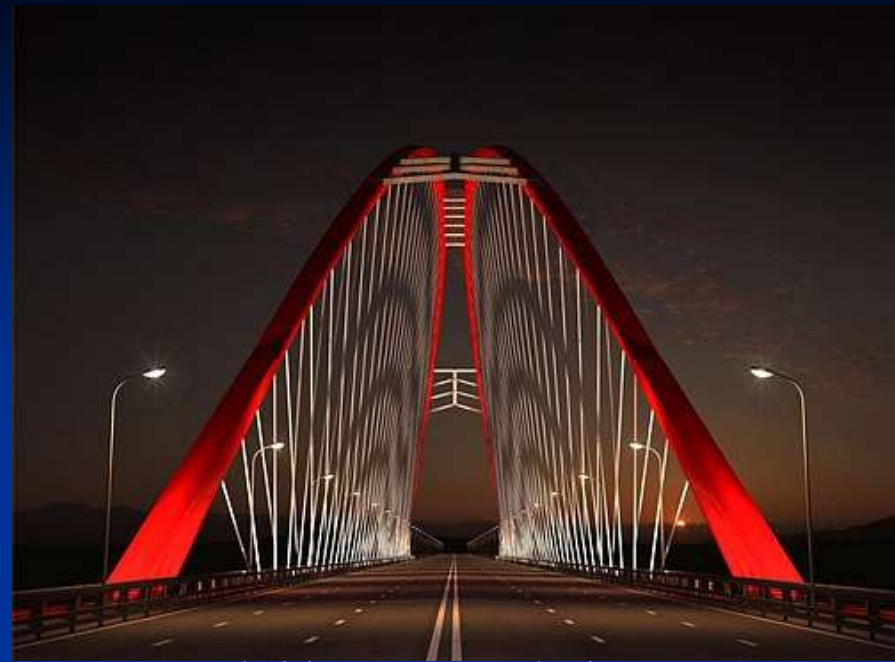
New bridge across Ob river

Novosibirsk is called the capital of Siberia. It is the biggest city in the area between the Urals and the Pacific Ocean and is the third largest city in Russia after Moscow and St.Petersburg with a population of more than 1,5 Million people.