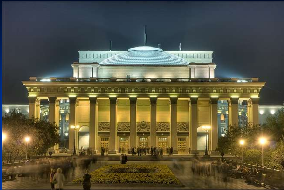
Novosibirsk Opera and Ballet Theatre