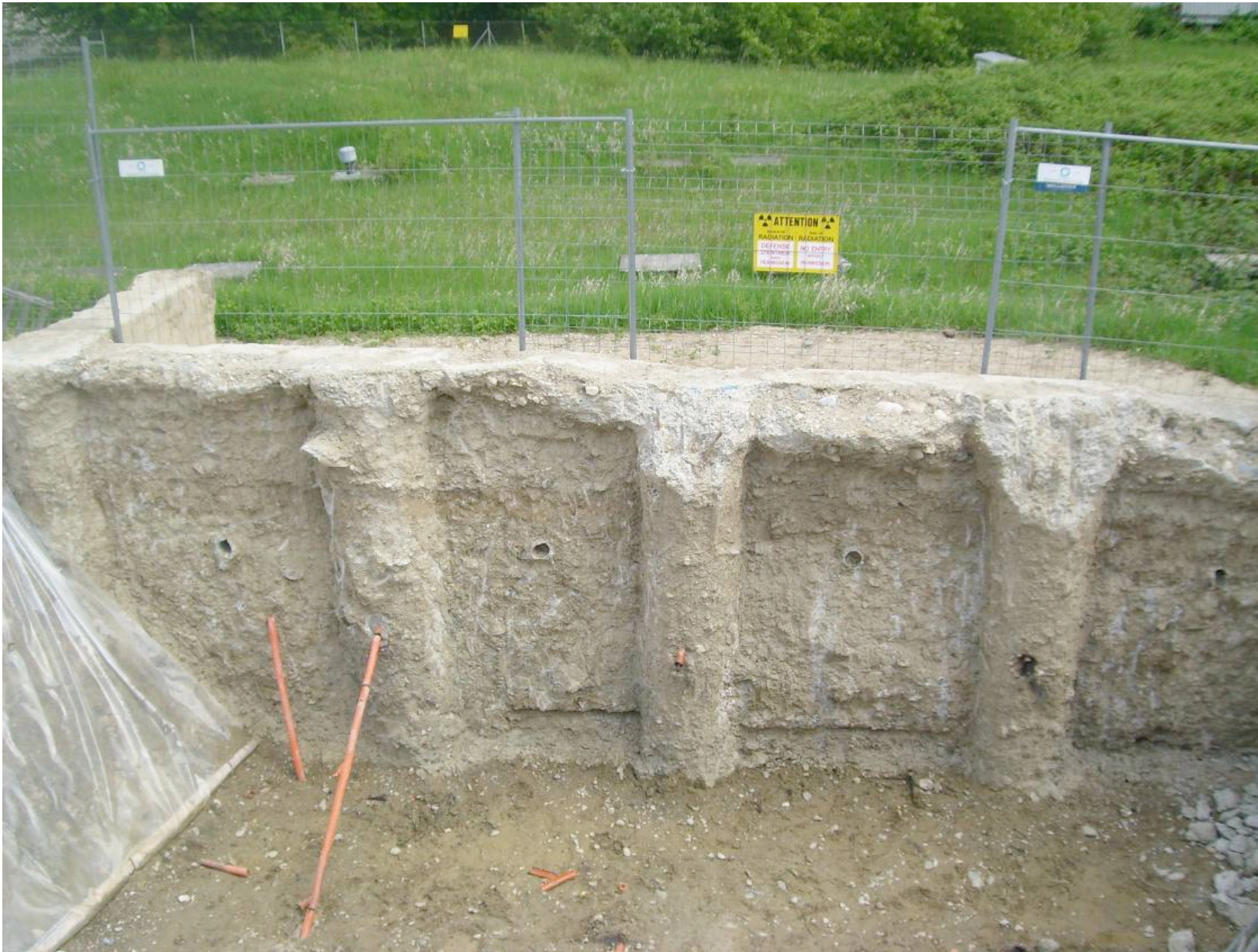
Connection point Linac4-Linac2 (to be excavated)