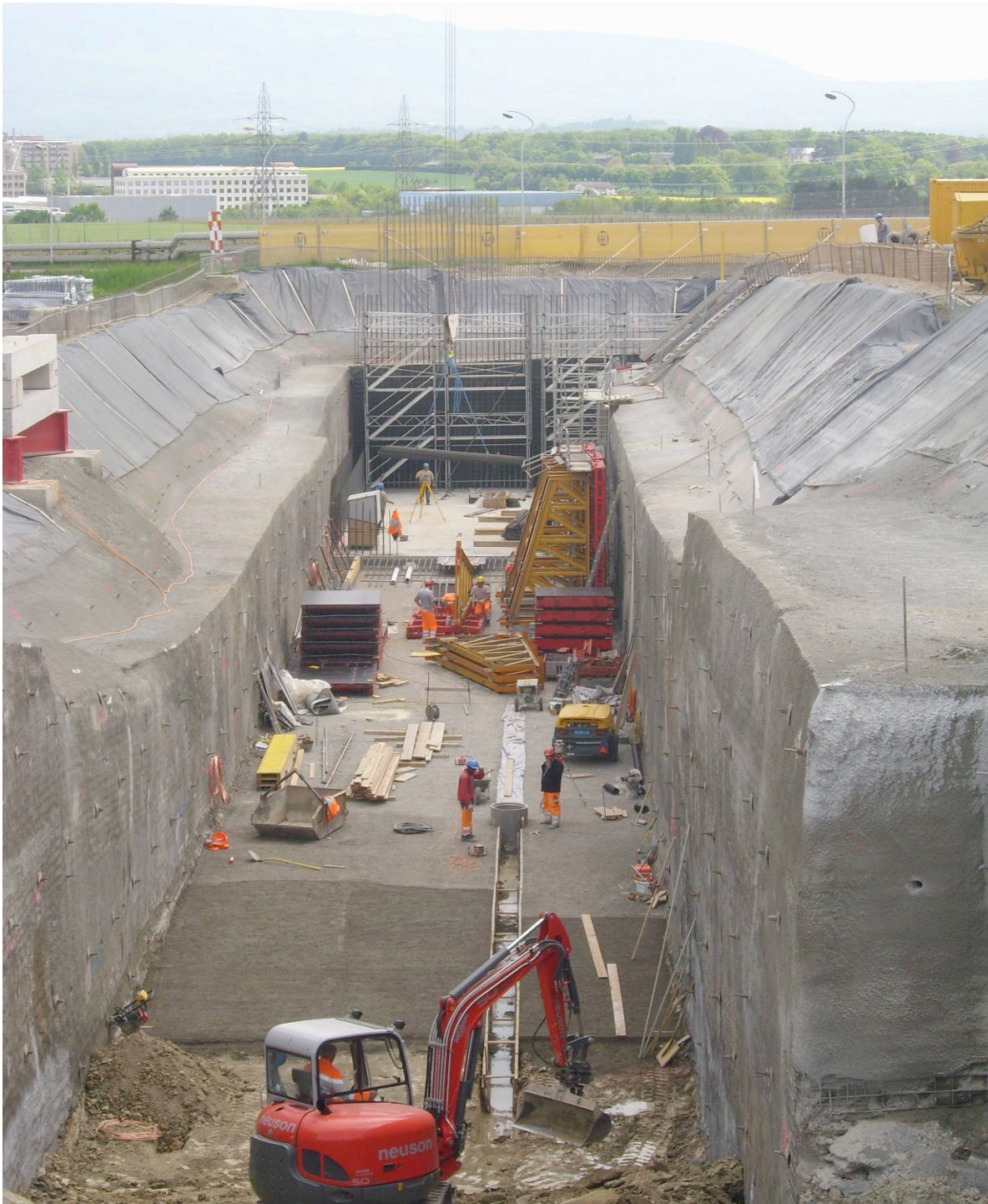
Concrete works on the low-energy side of the tunnel