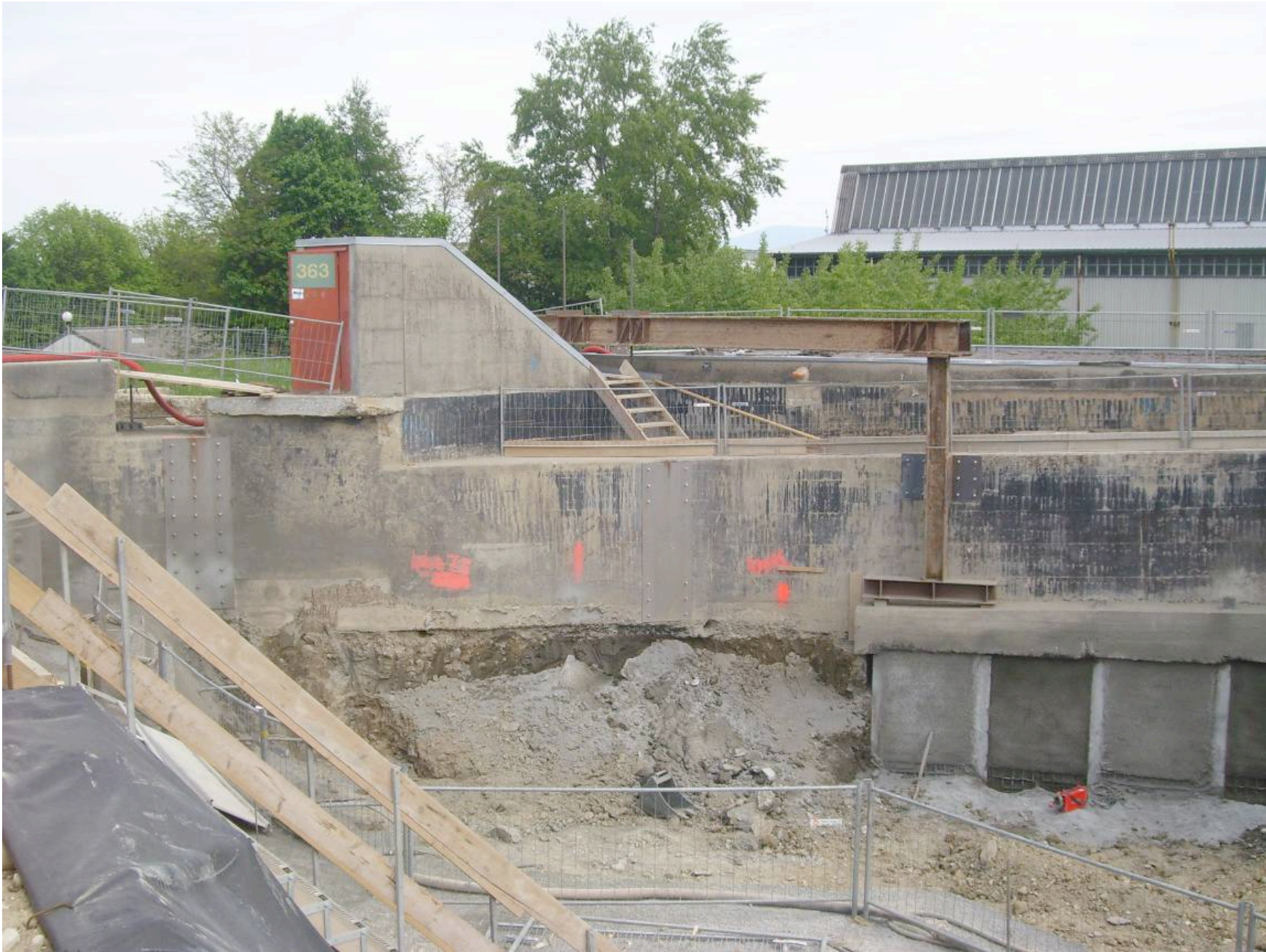
Transfer line under the old technical gallery connecting PSB and Linac2