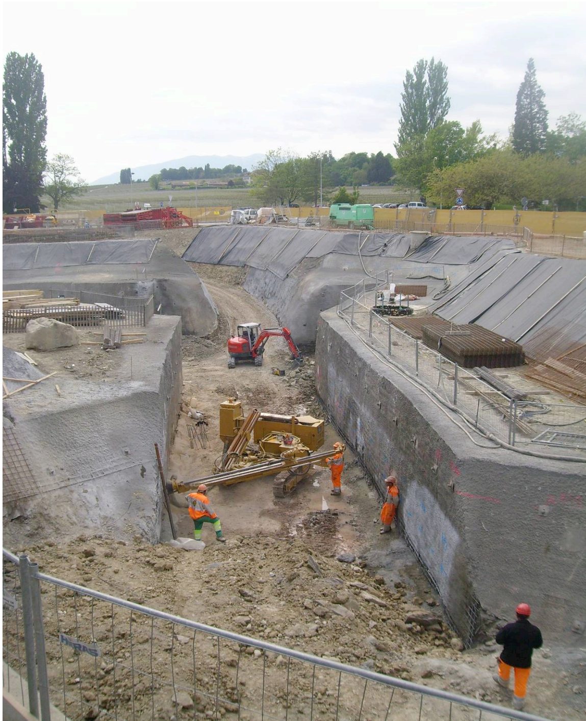
Transfer line tunnel (with machine drilling the reinforcement bars)