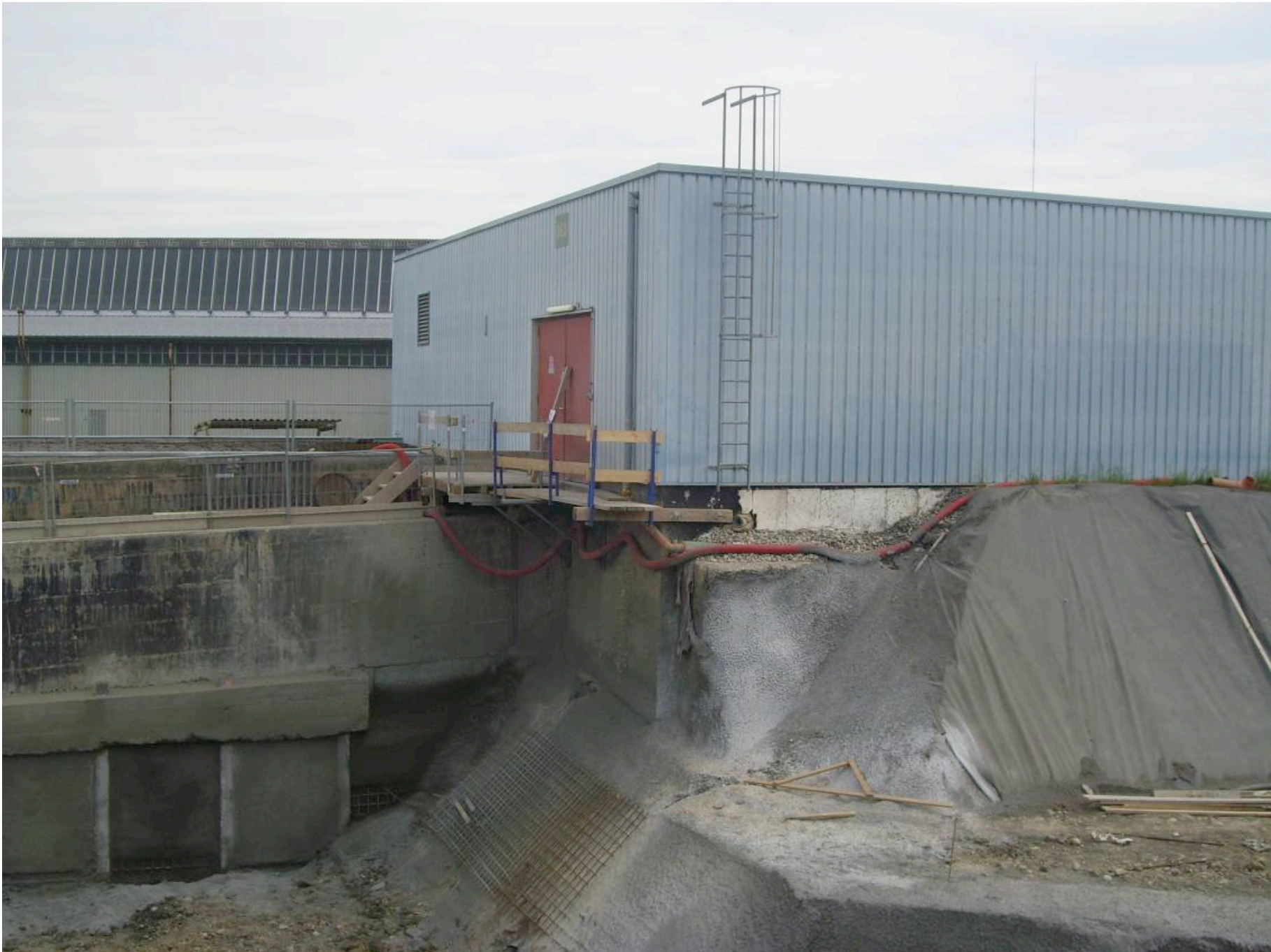
Excavations under the Linac2 CV Hall