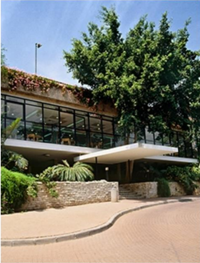
San Martin Guesthouse