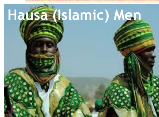
Hausa (Islamic) Men