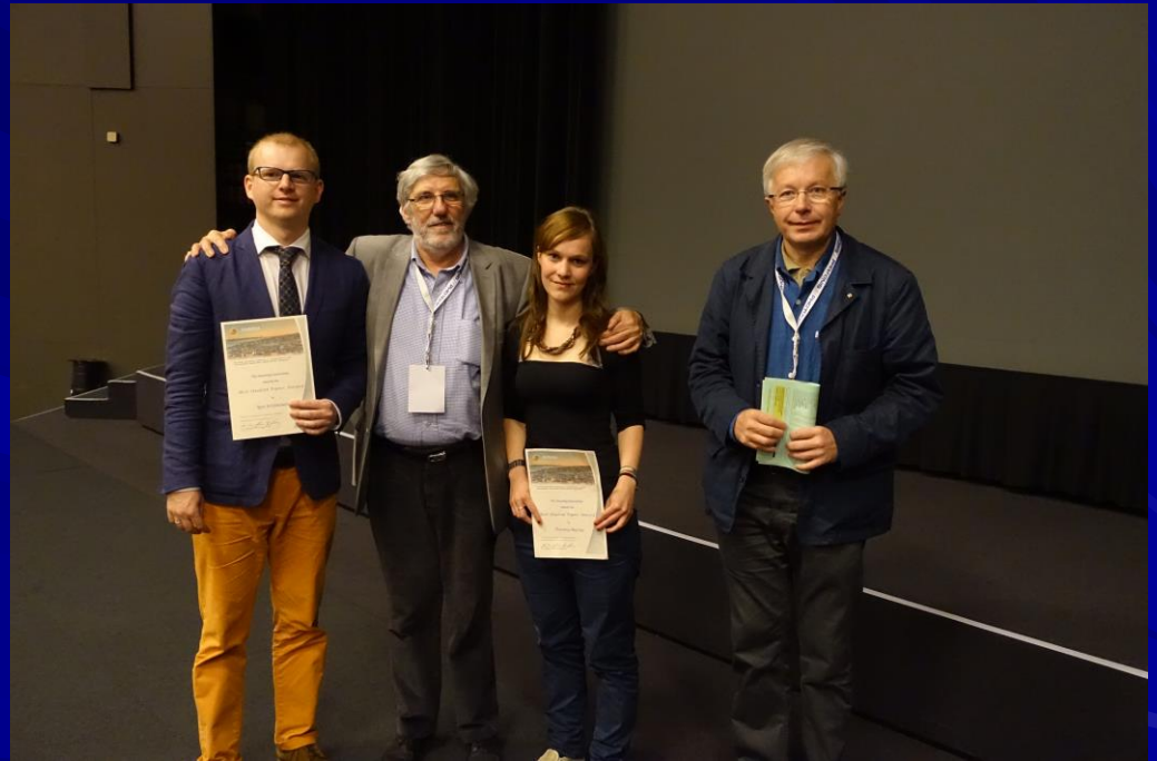
ANIMMA 2015 Student Award