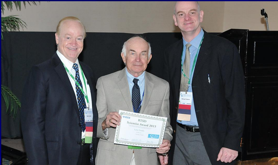
NSS Senior award