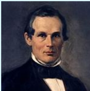
Anders Jonas Ångström (1814-1874)