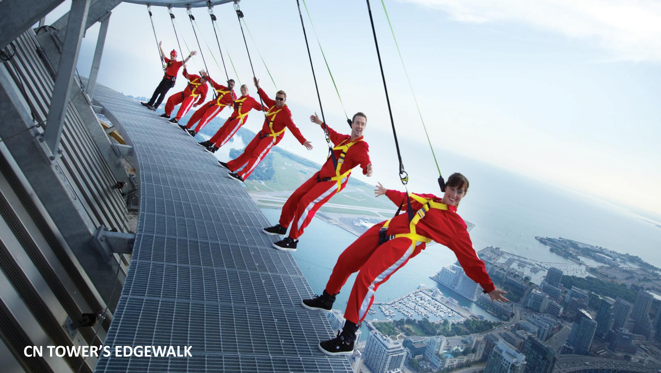
CN TOWER'S EDGEWALK