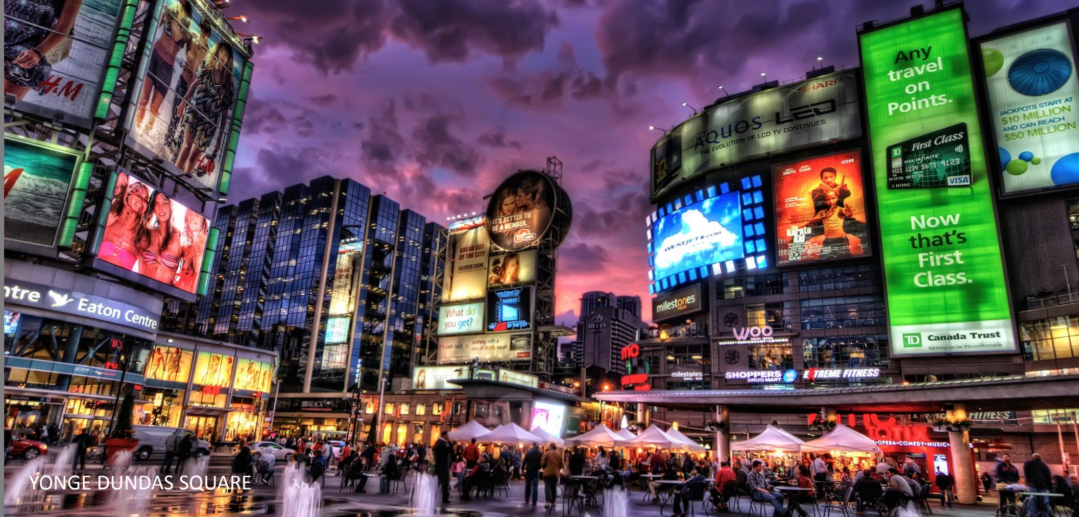
YONGE DUNDAS SQUARE