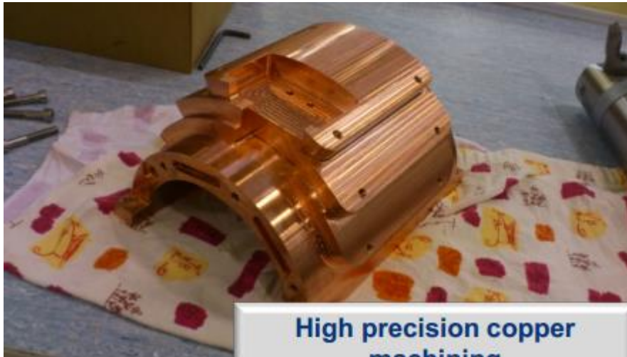
High precision copper machining