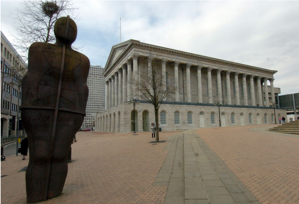
Iron Man (1993) Victoria Square, Birmingham