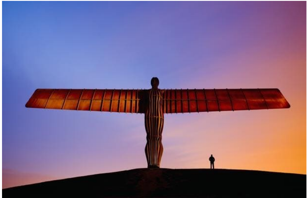
The Angel of the North (1998) (Overlooking A1 road as it enters Gateshead)