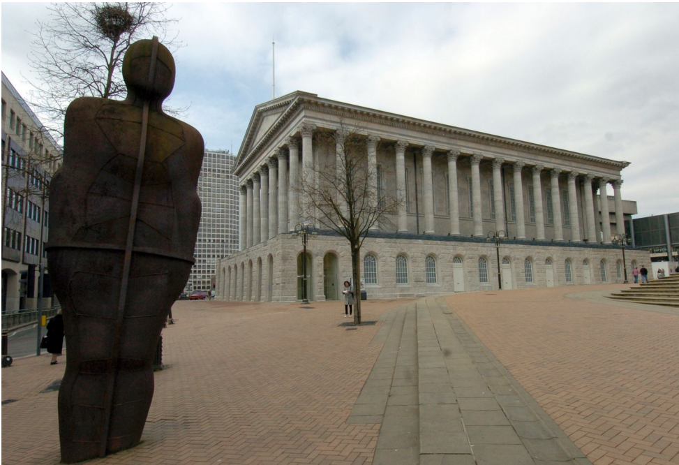
Iron Man (1993) Victoria Square, Birmingham