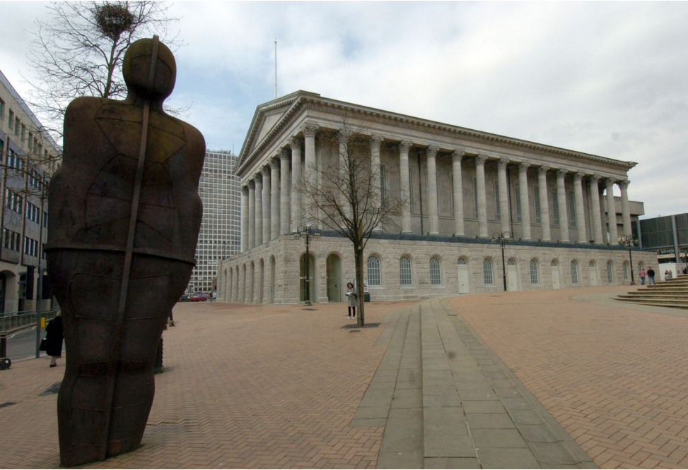
Iron Man (1993) Victoria Square, Birmingham