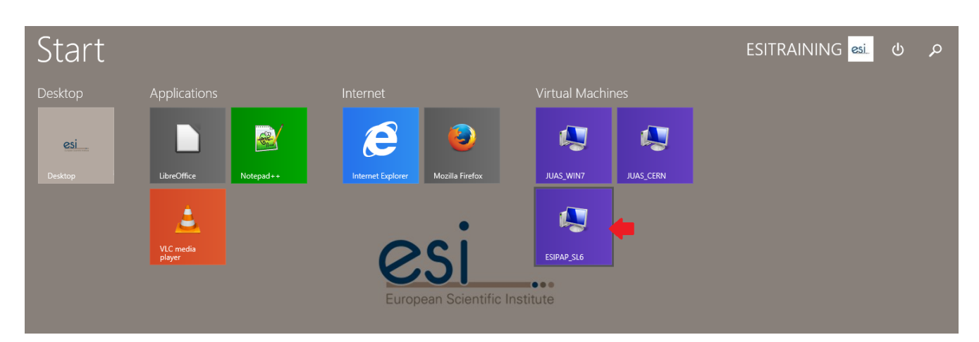
Figure 2: The screen showing the available virtual machines

According to Figure 2, click on the virtual machine called "ESIPAP_slc6". A password could be necessary and should be supplied by the supervisors.