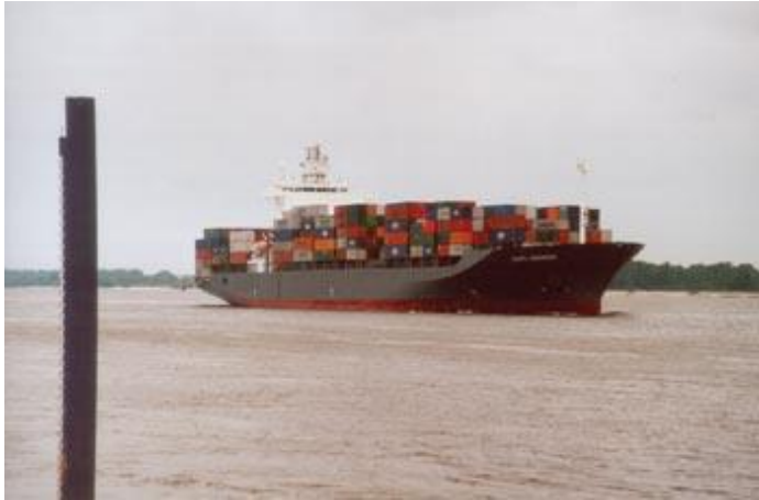
November 2002: BESSY sets sail