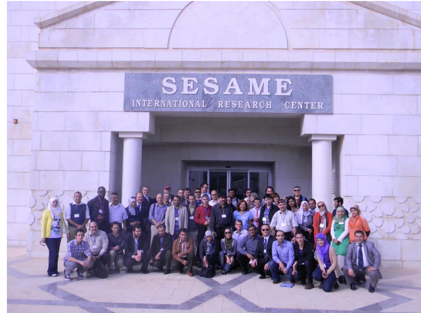
Selective awareness raising