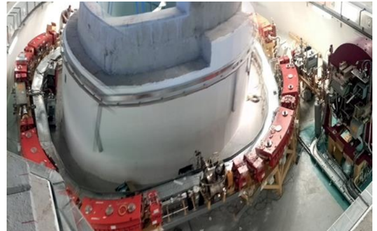
October 2014: 800 Mev