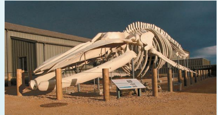
Skeleton of a Blue Whale that Beached Some Years Ago