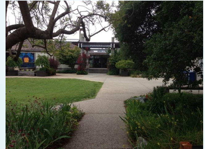
Entrance to the Porter College Dining Hall