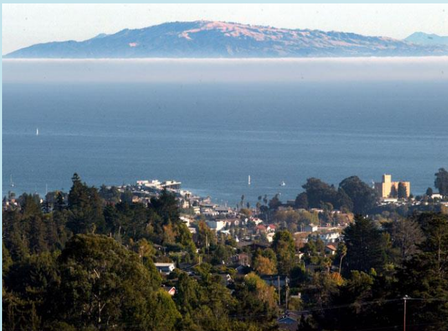
View of Monterey Bay from Campus