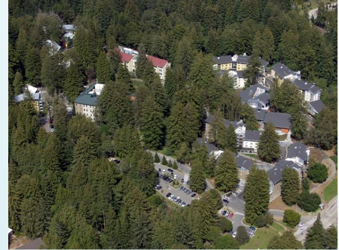
Part of the Forested Campus