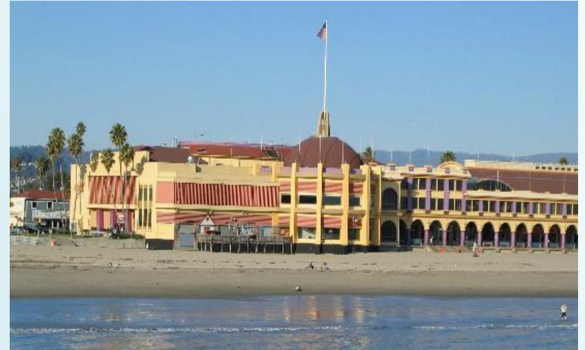
Coconut Grove Ballroom – Second Floor under the Dome