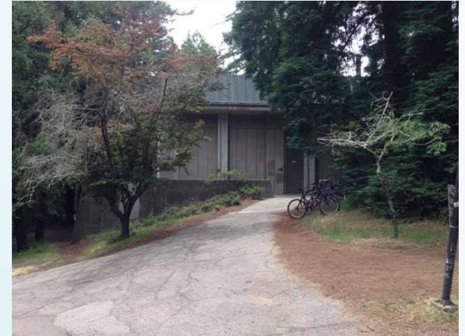
View of Thimann from E&MS