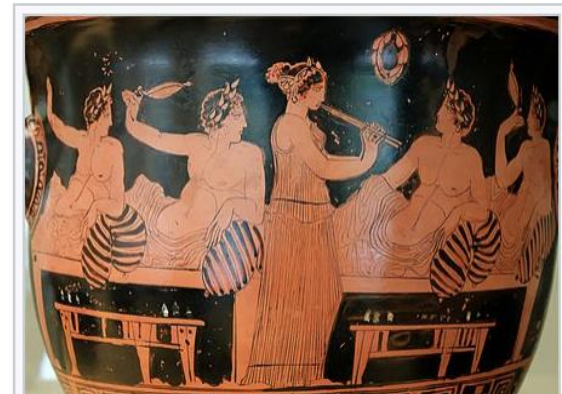
A female aulos -player entertains men at a symposium on this Attic red-figure bell-krater , c. 420 BC

In ancient Greece , the symposium ( Greek : συμπόσιον symposion or symposio , from συμπίνειν sympinein , "to drink together") was a part of a banquet that took place after the meal, when drinking for pleasure was accompanied by music, dancing, recitals, or conversation. [1] Literary works that describe or take place at a symposium include two Socratic dialogues , Plato's Symposium and Xenophon's Symposium , as well as a number of Greek poems such as the elegies of Theognis of Megara . Symposia are depicted in Greek and Etruscan art that shows similar scenes. [1]