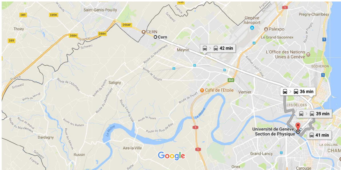
Données cartographiques ©2017 Google France 1 km