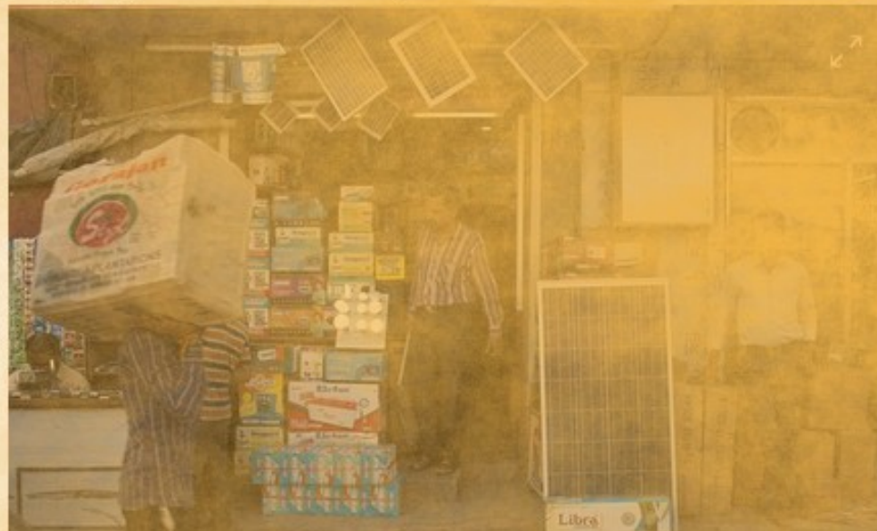
Solar panels for sale at a market in New Delhi. India's solar power prices have fallen to 2.62 rupees per kilowatt hour.

Plummeting wholesale prices put the country on track to meet renewable energy targets set out in the Paris agreement