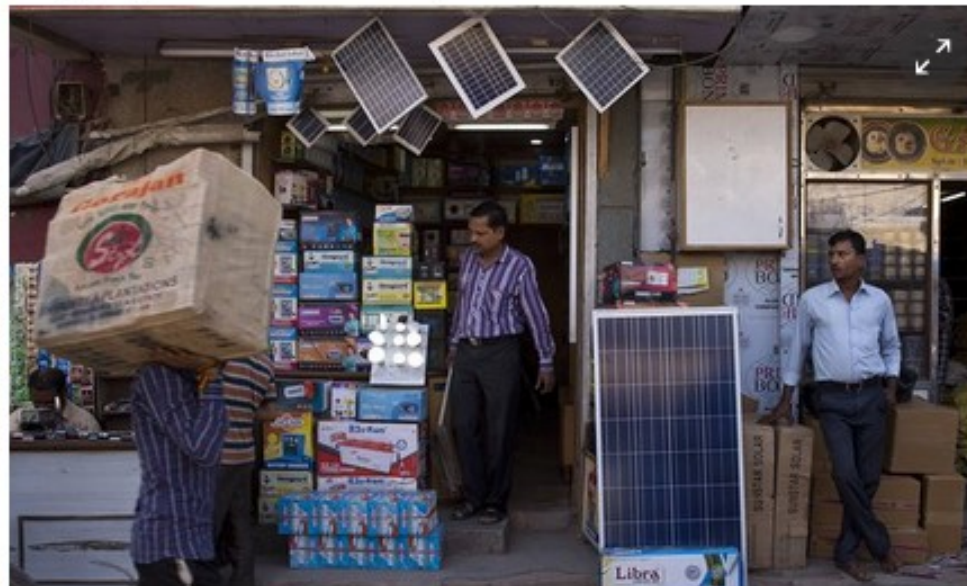
Solar panels for sale at a market in New Delhi. India's solar power prices have fallen to 2.62 rupees per kilowatt hour.

Plummeting wholesale prices put the country on track to meet renewable energy targets set out in the Paris agreement