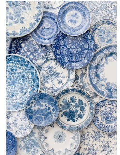
Chinese Tau cargo items