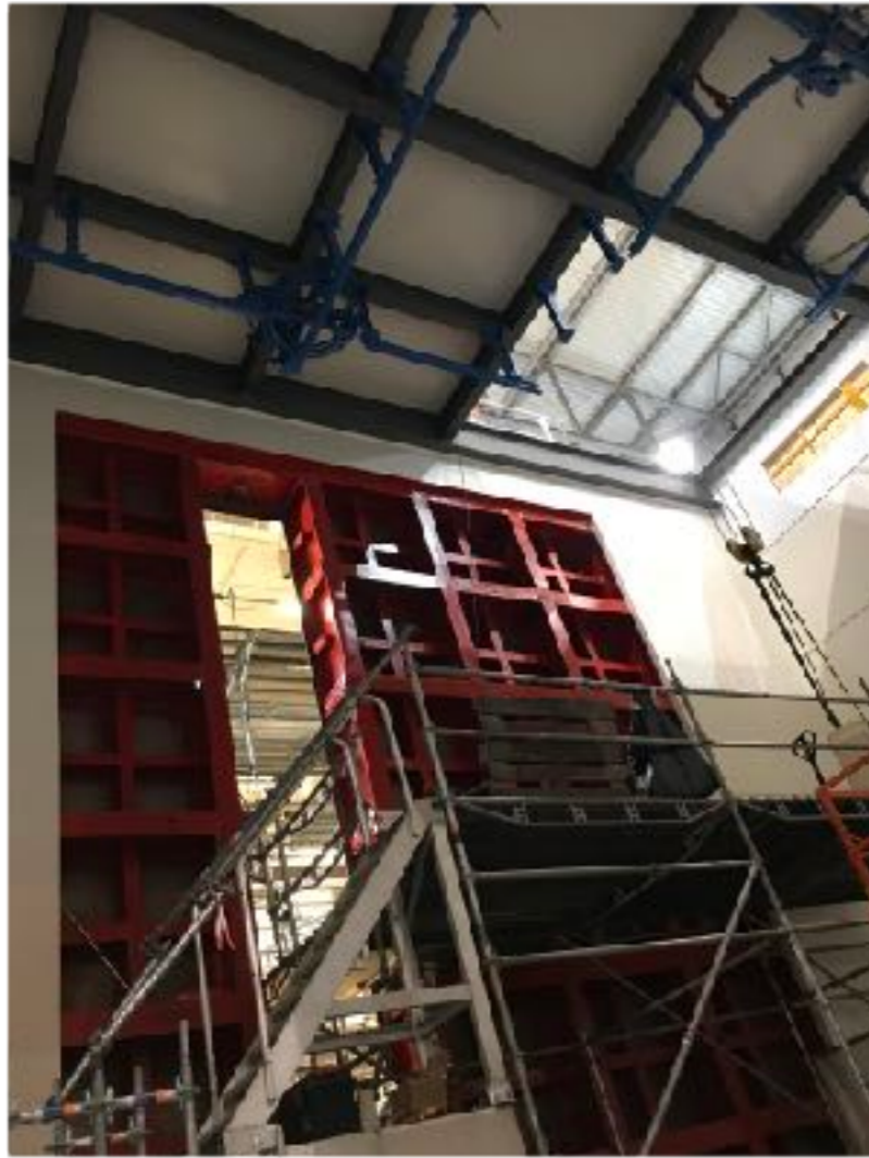
Rails and trolley system installed