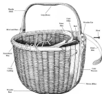
The Round Nantucket